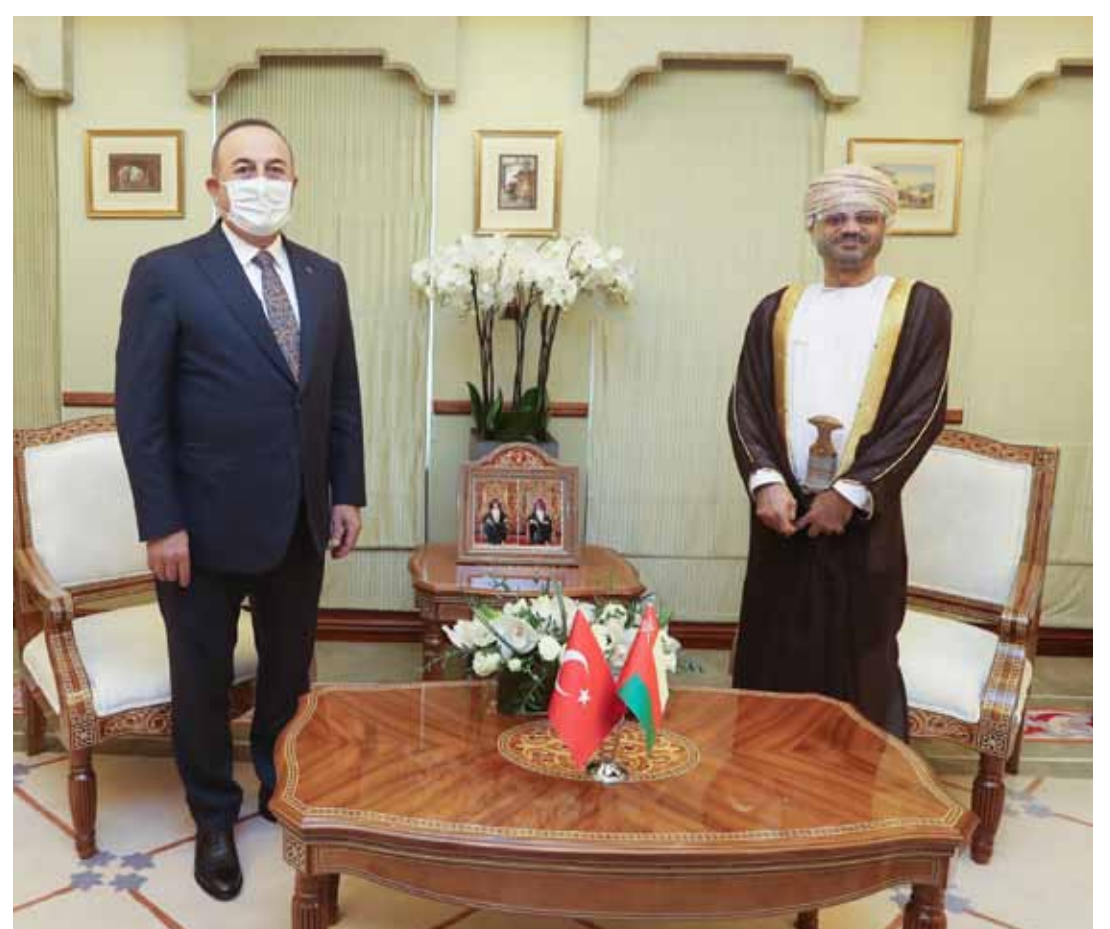
His Excellency Mevlüt Çavuşoğlu, Minister of Foreign Affairs of the Republic of Turkey and Oman Foreign Minister His Excellency Sayyid Badr bin Hamad bin Hamud Al Busaidi.

As a part of our general perspective towards the region, Turkey strives to increase its political, economic, social and cultural cooperation and engagement with friendly and brotherly countries, to the extent possible. In this framework, Turkey's vision for its future with Oman, in particular, is to develop social, economic and cultural interaction, within a stable environment, and on the basis of the win-win principle. With this vision, we wish and seek to increase the prosperity and well-being of not only the Turkish people, but also the brotherly people of Oman.